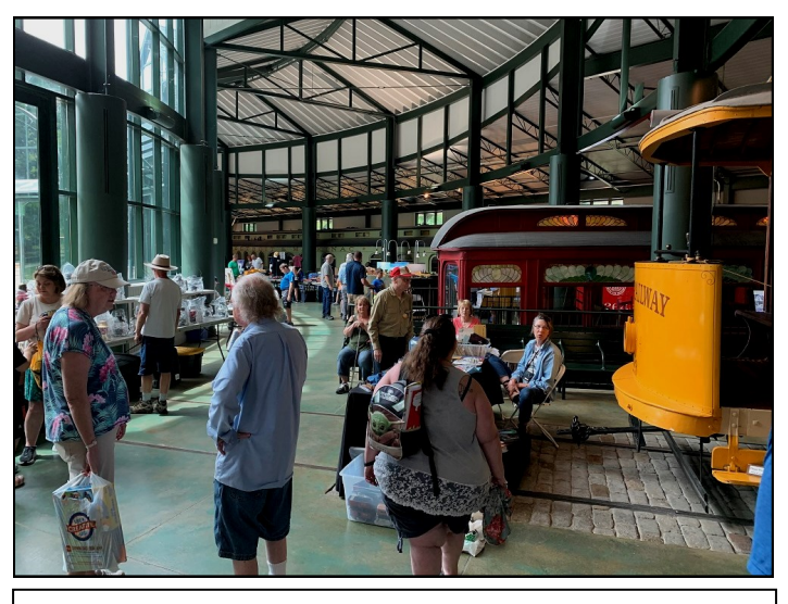
Vendors and historical equipment in the Roundhouse.