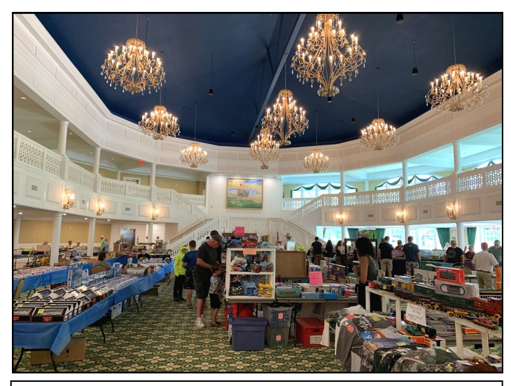
The retail portion of the event was held in a large, beautiful Ballroom, with additional booths in other rooms.