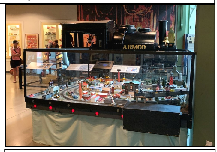
Across from our booth were an Armco locomotive and an interactive train layout for the kids.