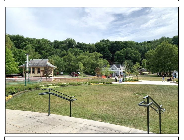
A view from the rear porch of the exhibit building. Note new Station building on the left with boarding platform.