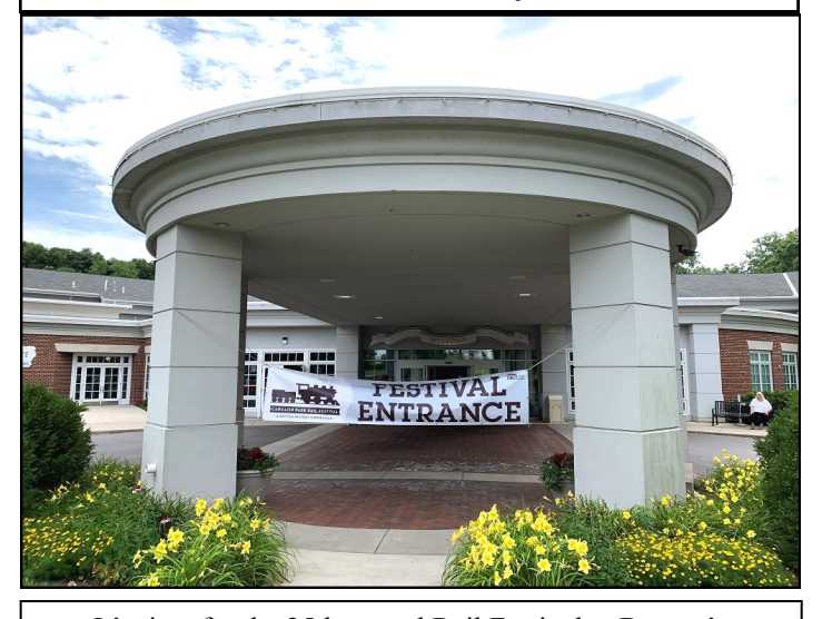
It's time for the 25th annual Rail Festival at Dayton's Carillon Park! We had a booth in the main building.