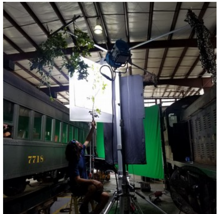
Special effects outside coach #9. John Sprinkle

The railroad has canceled all five Metamora Canal Days Limited trains scheduled for October 2, 3, and 4. Replacing them will be a Fall Foliage Flyer on October 2 at 10:01 am, and Valley Flyers on both October 3 and 4 at 12:01 pm. Crews from the October 3 and 4 10:01 am trains are encouraged to fill in open spots on the Valley Flyer or Metamora Local trains.