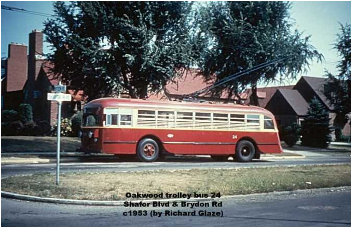
Oakwood trolley bus 24 Shafor Blvd & Brydon Rd c1953