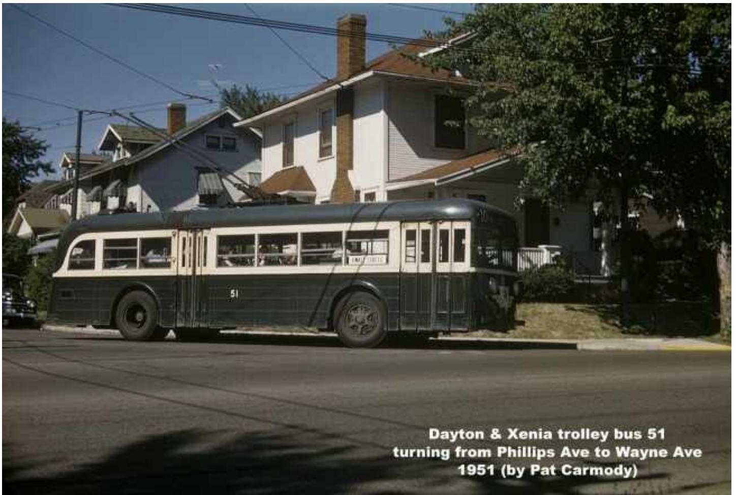
Dayton & Xenia trolley bus 51 turning from Phillips Ave to Wayne Ave 1951