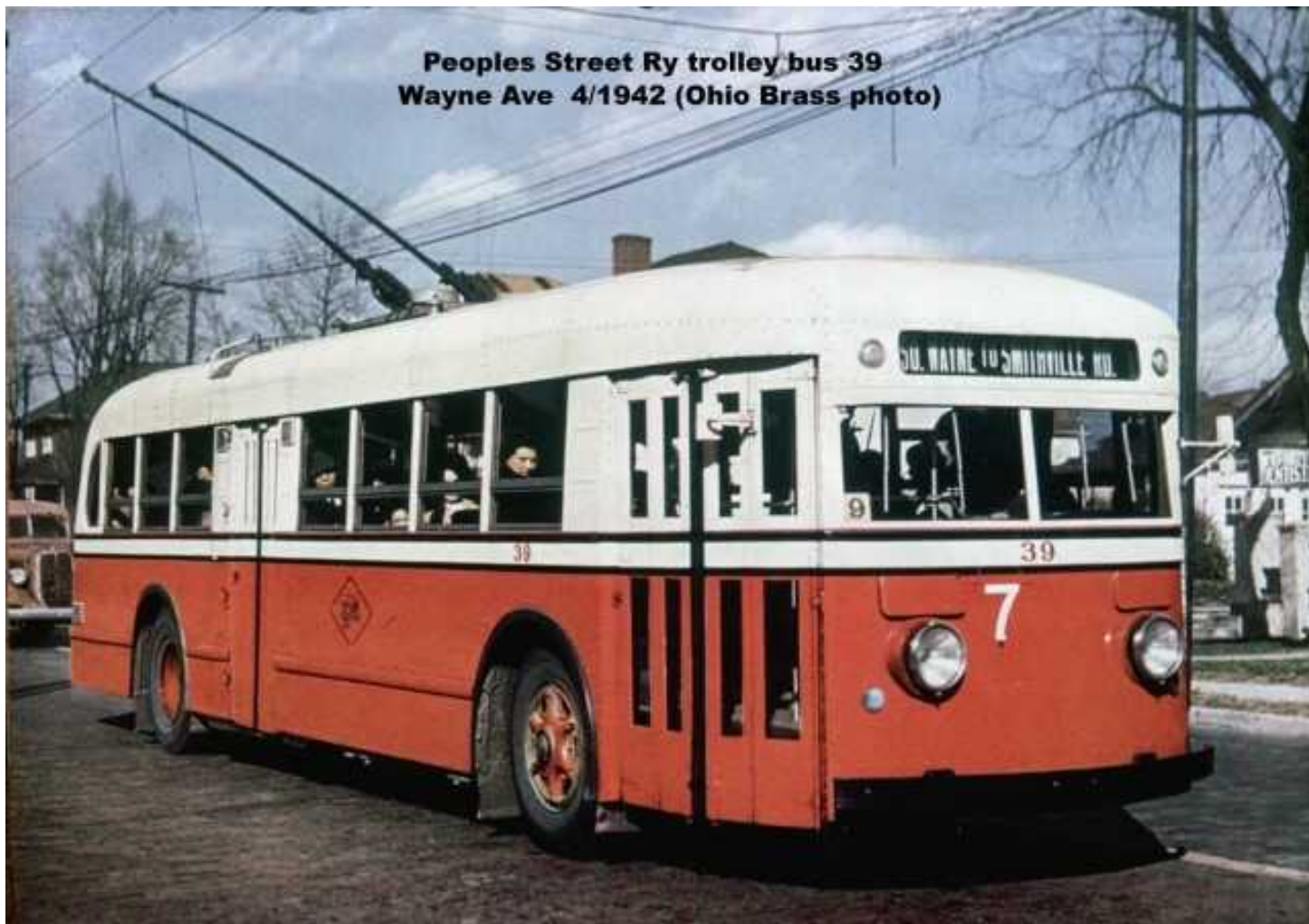
Peoples Street Ry trolley bus 39 Wayne Ave 4/1942