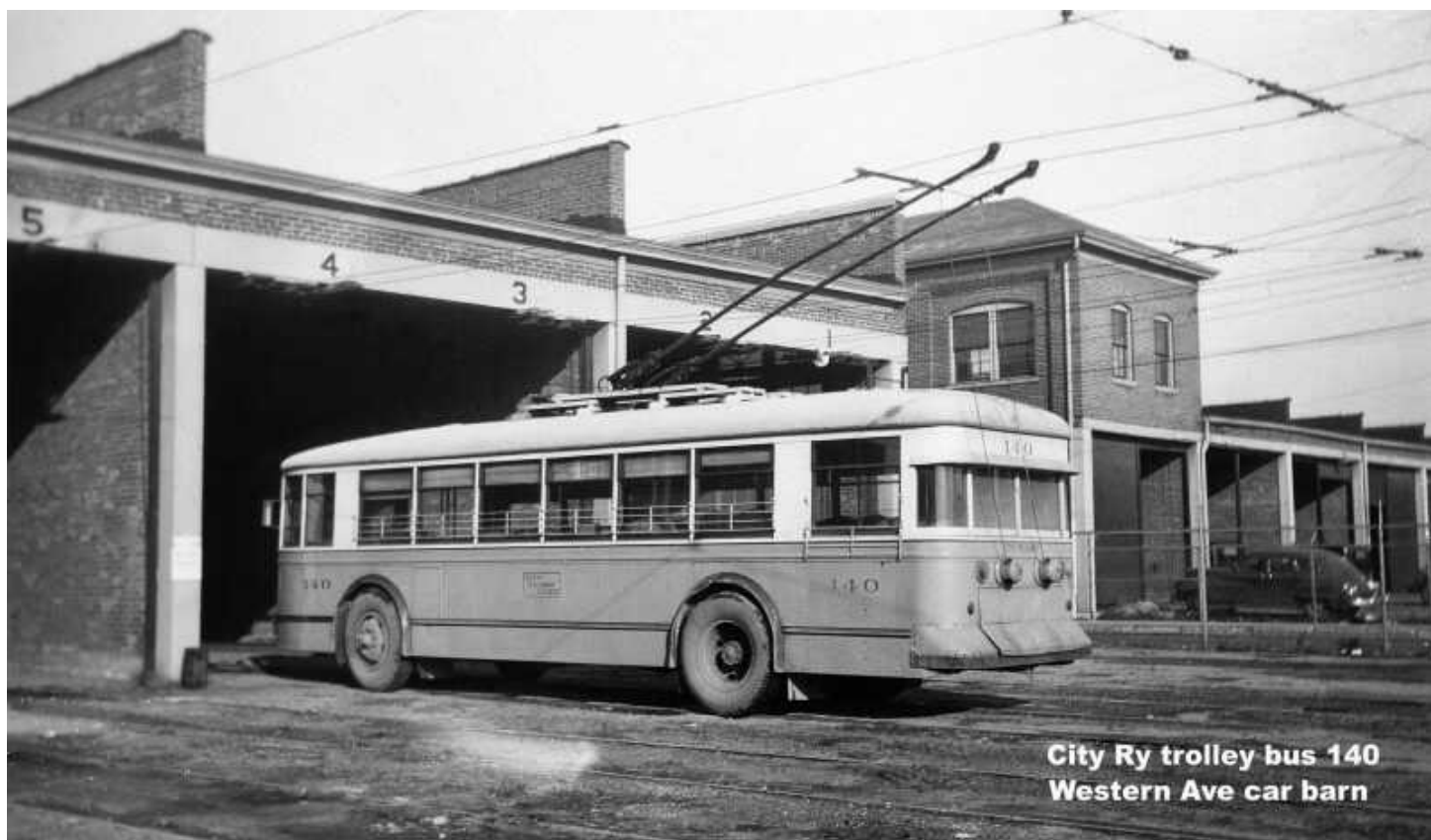
City Ry trolley bus 140 Western Ave car barn