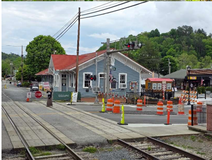
[Left] Well, we have arrived back to the depot after a nice ride. There is still a little construction going on, next to the depot as you can see. Then ack to the buses for our trip back to Johnson City.