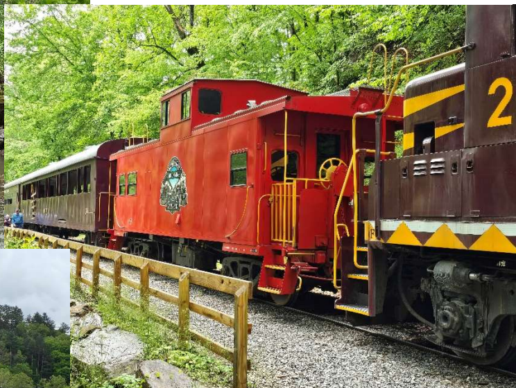
[Above] After we stopped for the layover, I walked to the back of the train, the front end as we return, and took a shot of this neat caboose. I would like to take a ride in it someday.