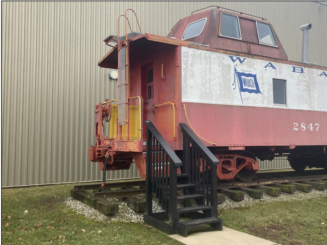
Wabash Caboose 2847 before receiving its new paint