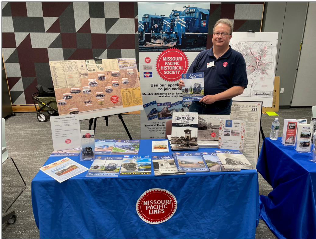
Top: The Event at the St. Louis County Library Headquarters.