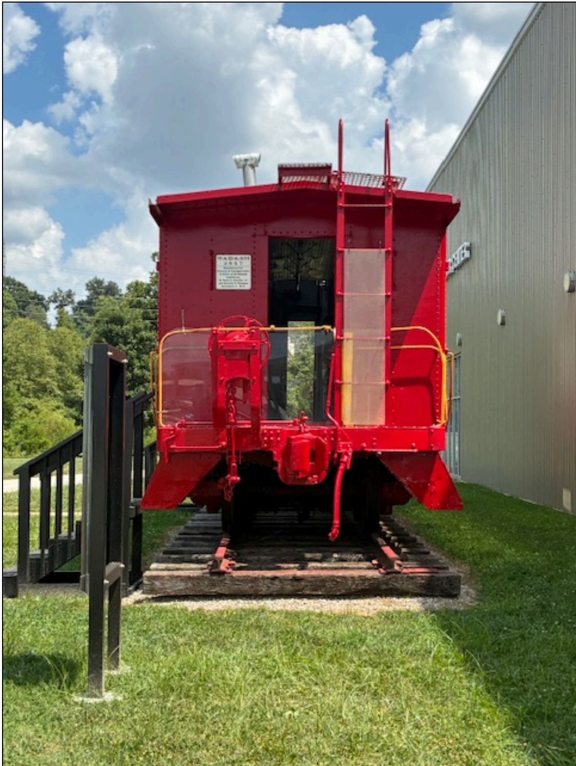
After the repainting.