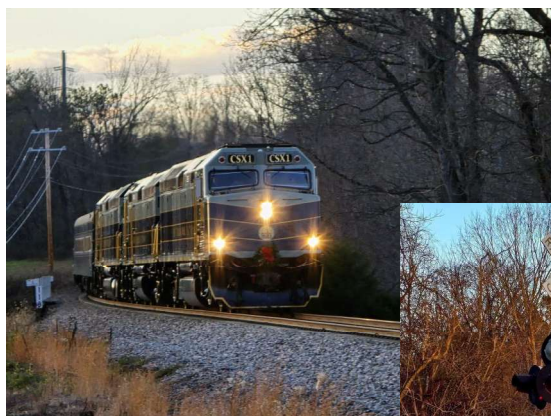
Embreeville Road Crossing (JC)